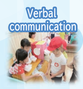
Children will learn to enjoy expressing themselves verbally and listening to the opinions of others